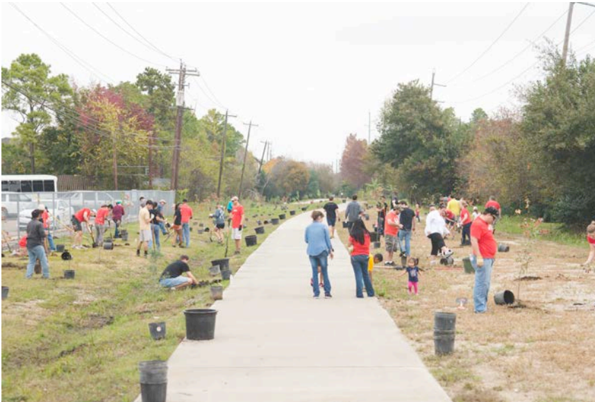
Kirksey Architecture employees gathered to plant trees along the recently revitalized Columbia Tap Trail.