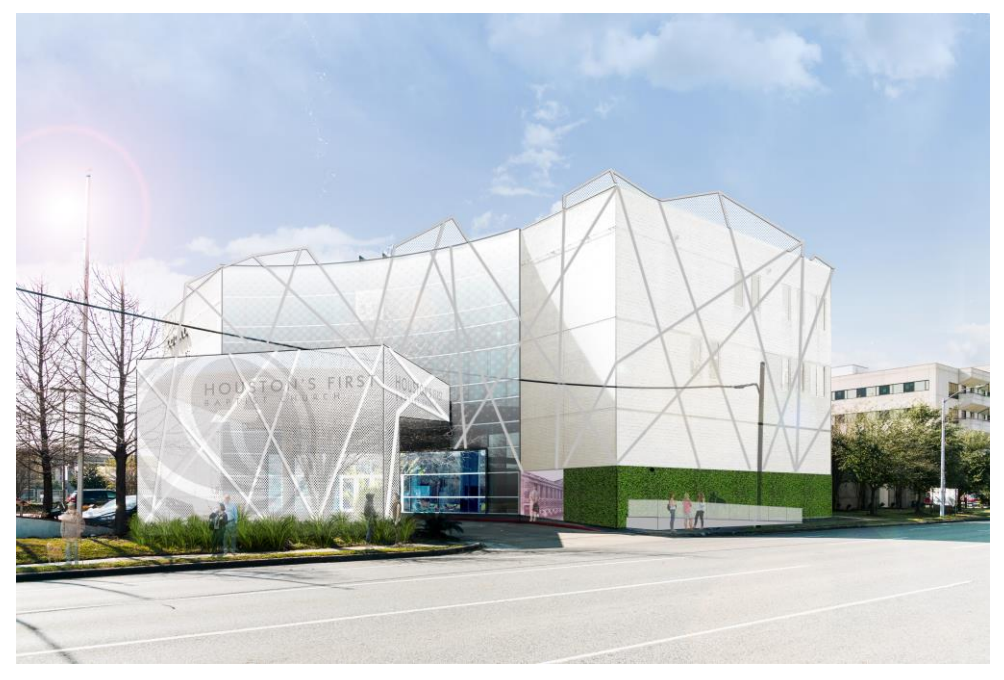
CAPTION: Kirksey designed Houston's First Baptist Church's new downtown satellite campus, located at 1730 Jefferson. The design is a renovation of an existing three-story office building, and will house the church's downtown congregation.