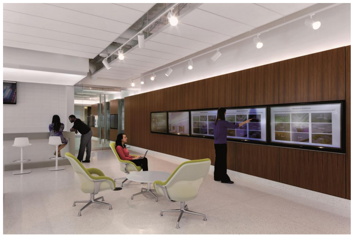
PHOTO CAPTION: The Diamond Center includes a Customer Interface Center that houses product displays, interactive graphics and information, and plug-and-play presentation areas.