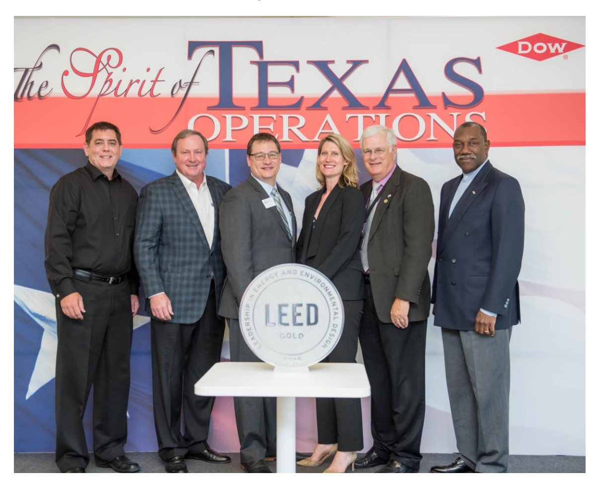
PHOTO CAPTION: The Dow Diamond Center receives a LEED Gold Plaque for its sustainable features, designed by Kirksey Architecture.